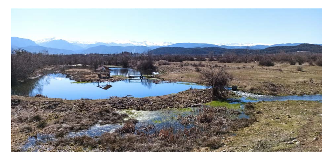
Restored wetlands and streams along the Upper Iskar River at Dragushinovo Village – potential habitats of native crayfish populations

Around 18:30 Arrival at Park Hotel Moskva.